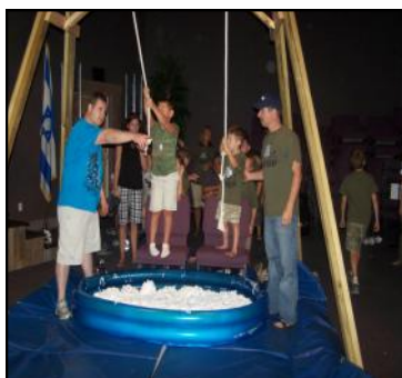
THE DREADED SHAVING CREAM POOL